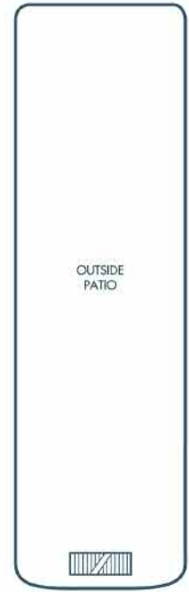
3rd deck Outdoor Patio